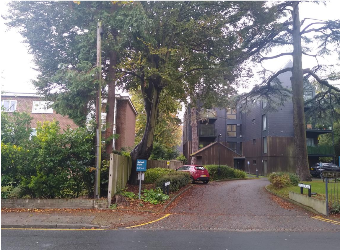
View from Langley Road