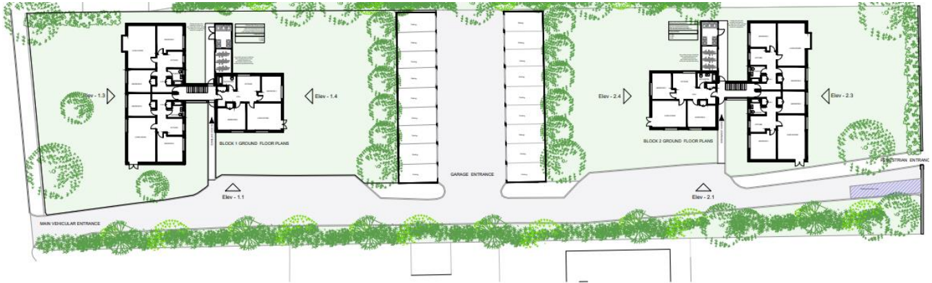
1 Proposed Site Plan Scale: 1:200