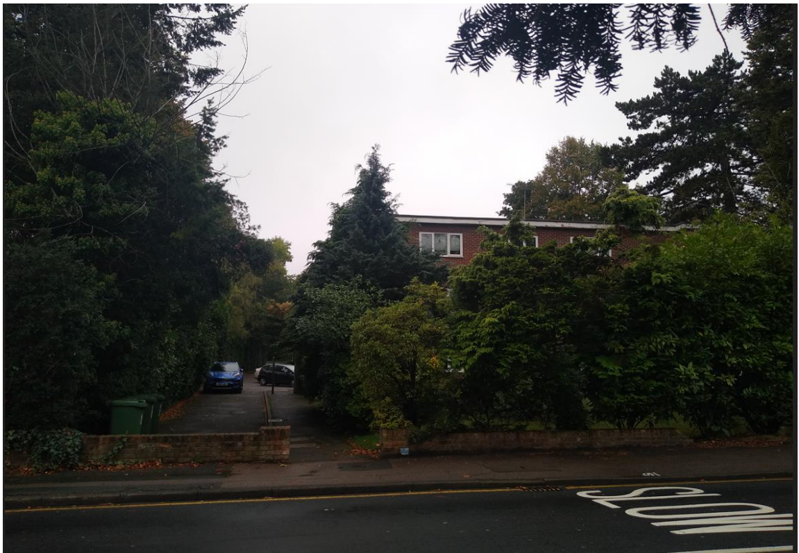
View from Langley Road