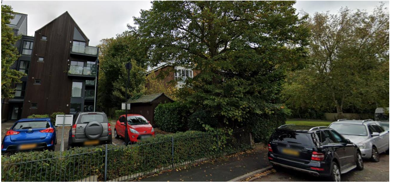
View from Grandfield Avenue